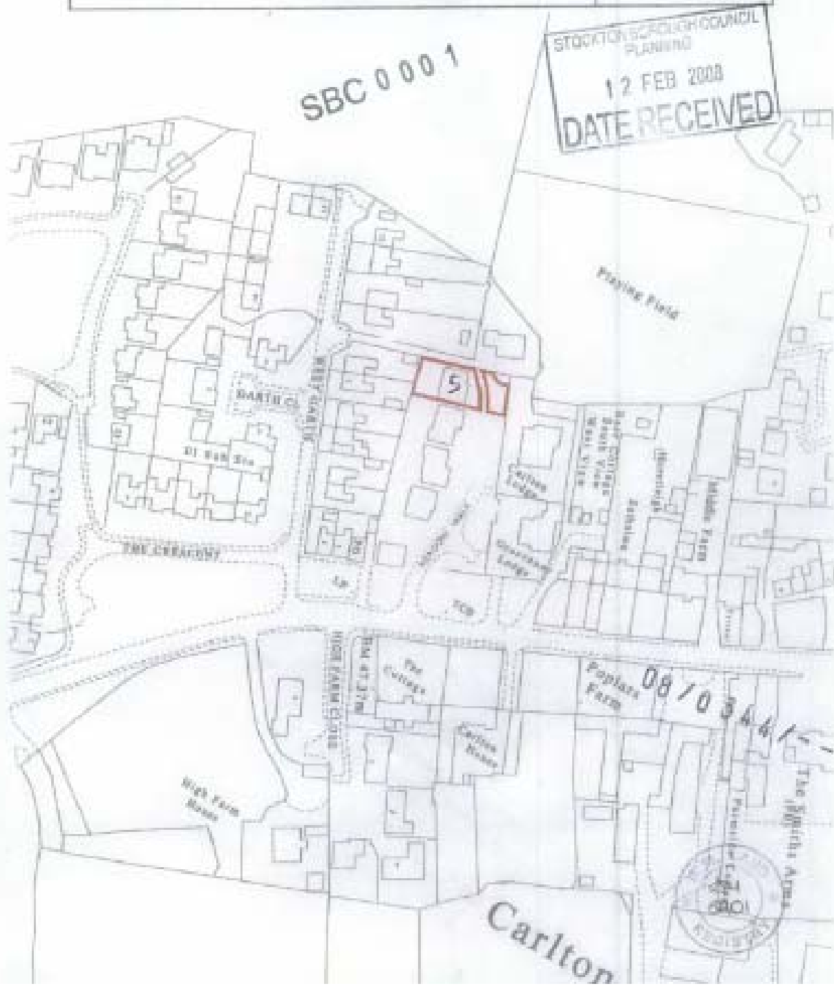
08/0344/FUL APPENDIX 1 – OS Map